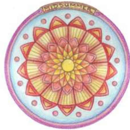
By Spiral Path Designs

As is consistent with the values and beliefs of our religion, the Covenant affirms our belief in the spiritual and social wisdom of peace in the world. We aspire to stand in fellowship with the people of all religions, cultures, and ethnicities in our shared desire for peace. We do this for the sake of our shared love of the Earth and all living things that dwell upon it.