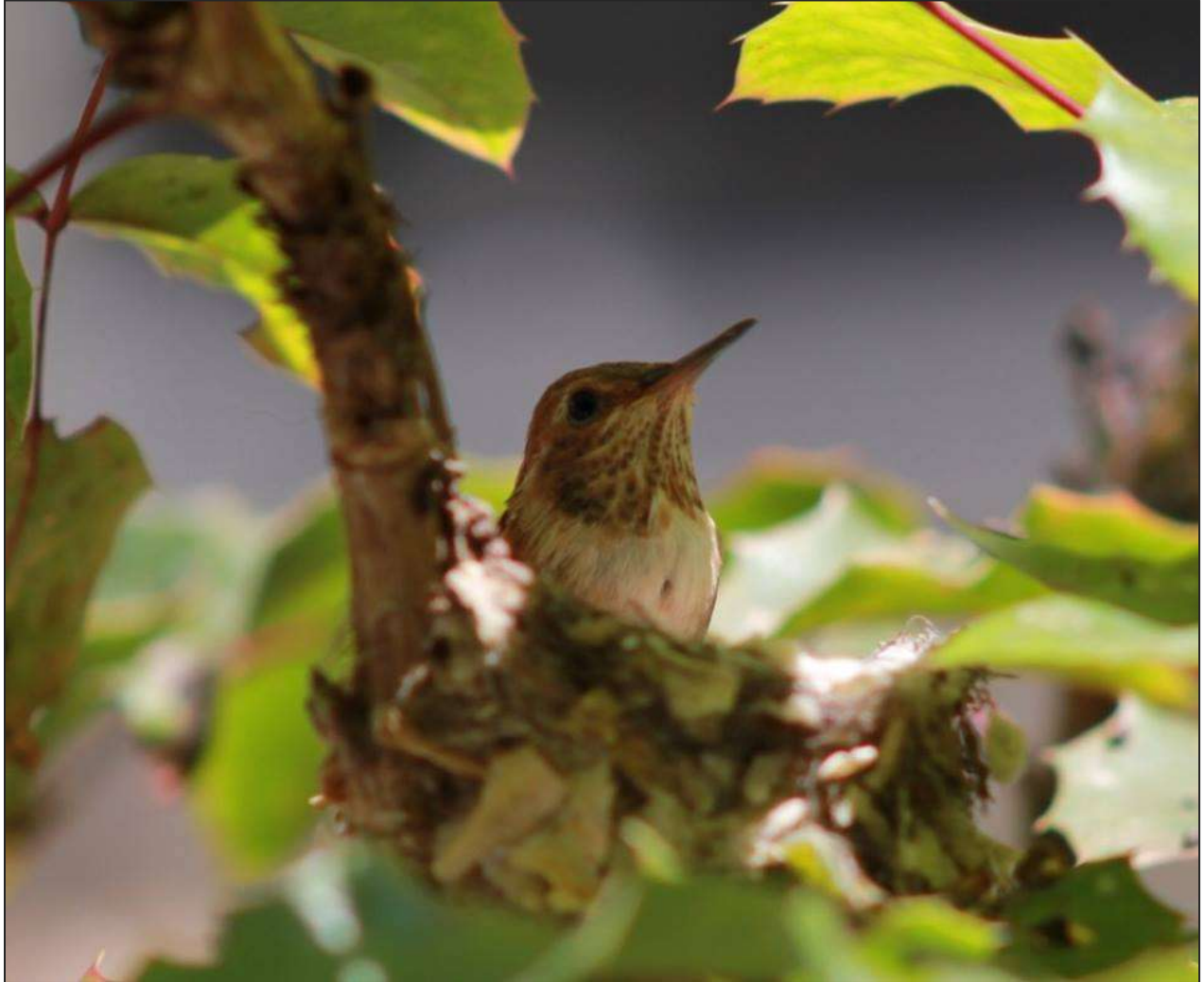
Springtime Hummingbirds