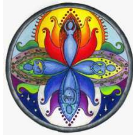
Goddess Mandala

As is consistent with the values and beliefs of our religion, the Covenant affirms our belief in the spiritual and social wisdom of peace in the world. We aspire to stand in fellowship with the people of all religions, cultures, and ethnicities in our shared desire for peace. We do this for the sake of our shared love of the Earth and all living things that dwell upon it.